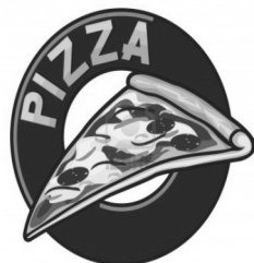
2 pieces of Pizza, and Salad For $5.00

Take a night off from cooking! Join us on Thursday, September 29 th for a pizza dinner. Look for pre-sale envelopes to come home closer to the event date. The cost is $5 for 2 slices of pizza and salad – it's the best deal in town! Drinks and dessert will be available for purchase that night. The book fair will also be